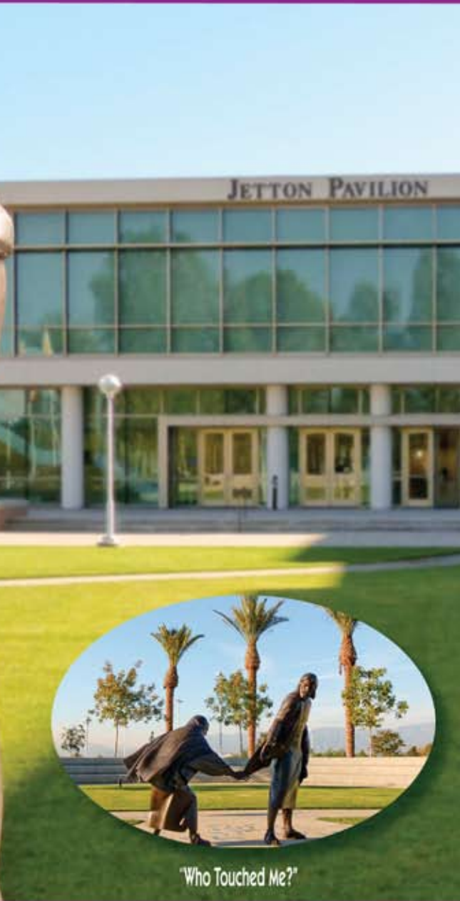
"Who Touched Me?"

79th Annual Postgraduate Convention • March 4-7, 2011